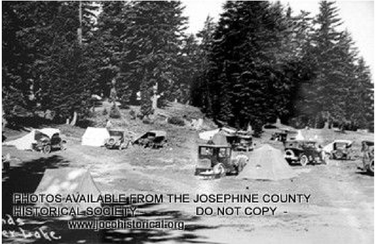
1919 Crater Lake Rim Camp