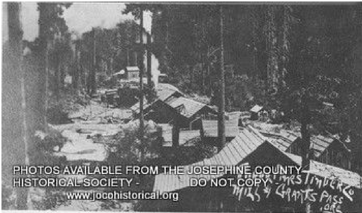
Three Pines Mill at Mountain 1910