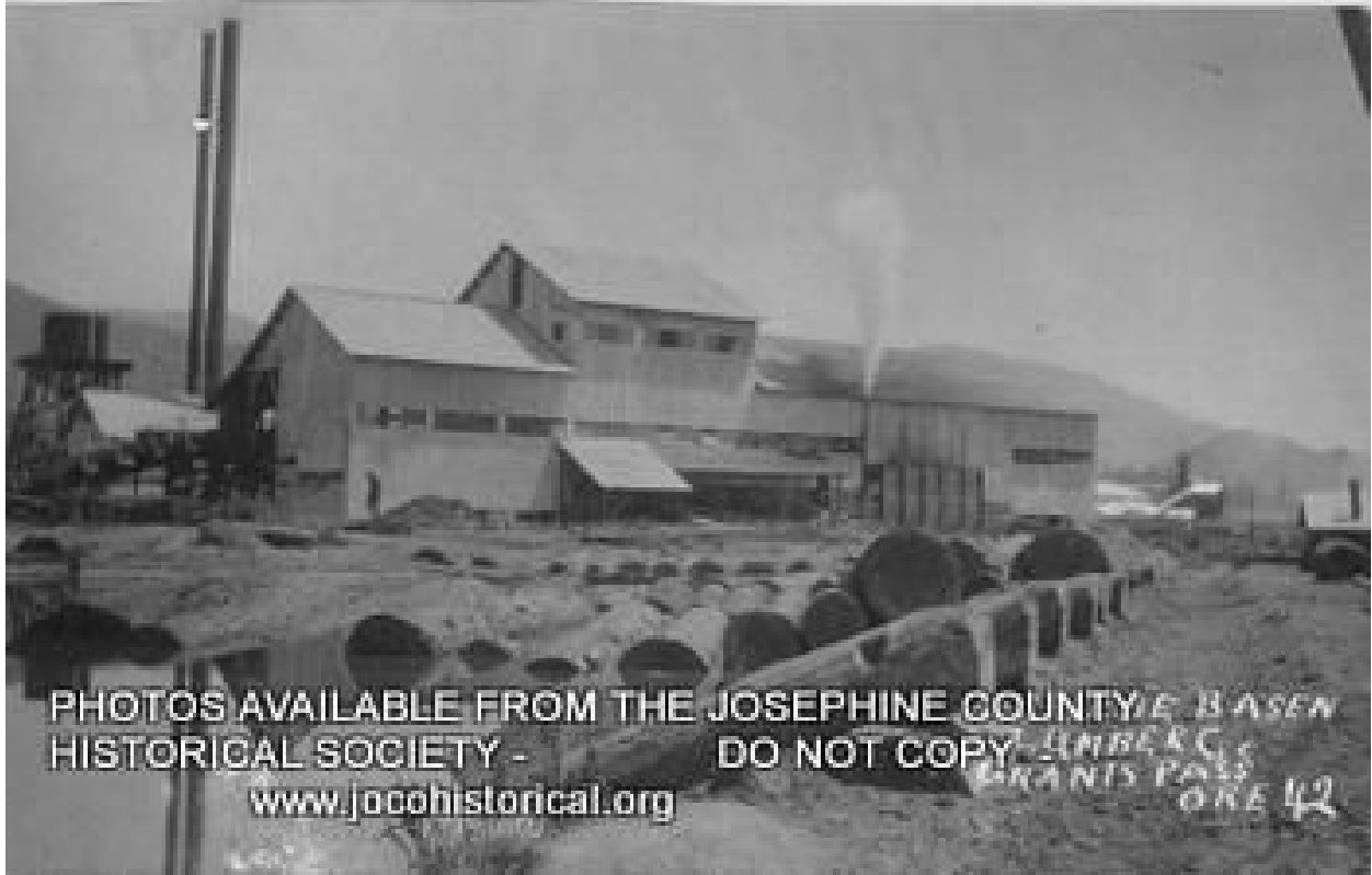
Swede Basin Sawmill east Grants Pass const 1928