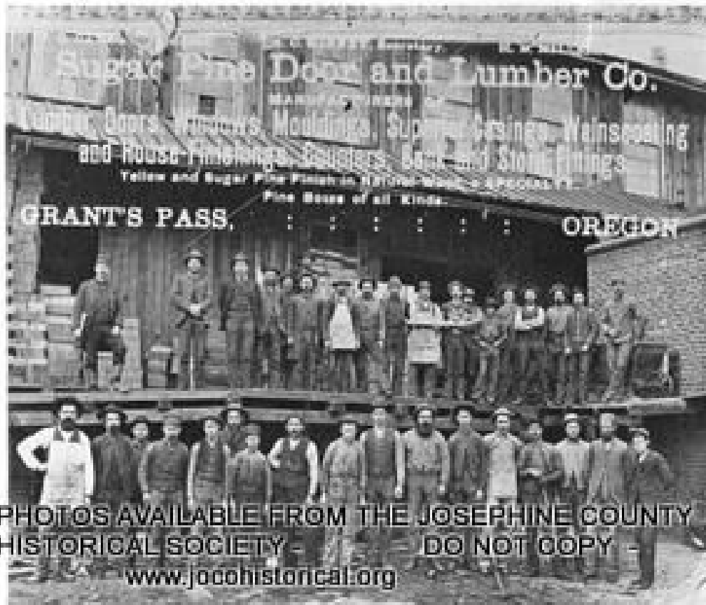
Sugar Pine Door & Lumber Co